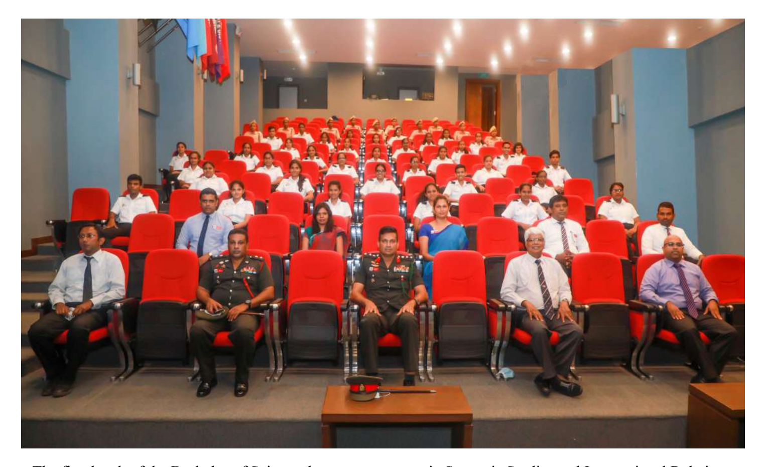
The first batch of the Bachelor of Science degree programme in Strategic Studies and International Relations with the DSS staff.