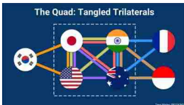
Figure 2: The Quad: Tangled Trilaterals